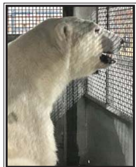
Cargojet carried two very special guests recently, "Missy the Coyote" and "Henry the Polar Bear"