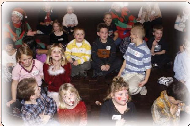
Children in Awe of Santa ...