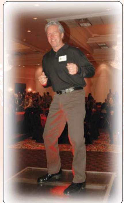
Definitely Needs Dance Lessons!