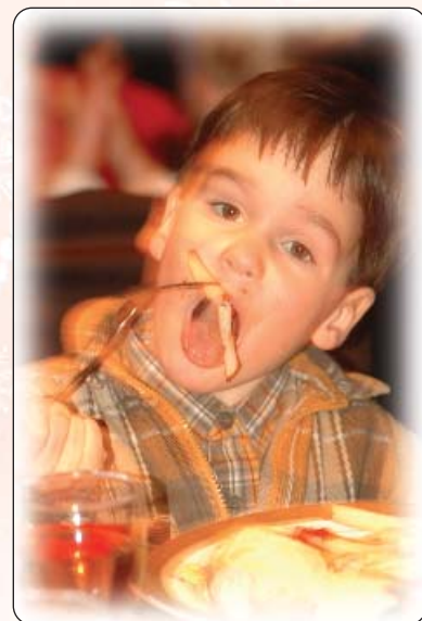
Enjoying the Feast!