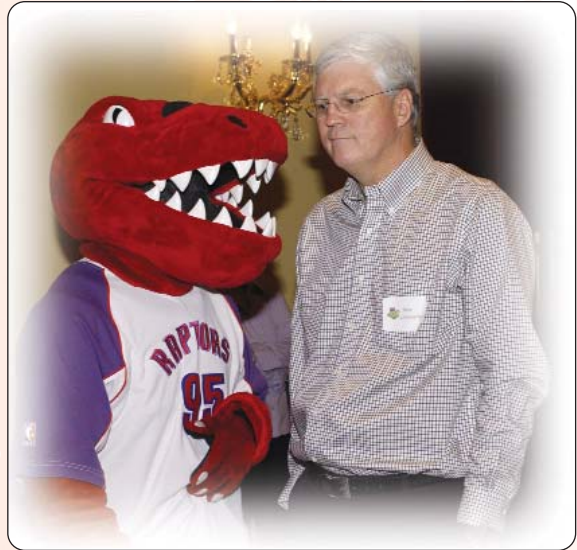
New Addition to The Starjet Sales Team!