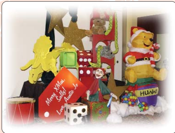
Santa's Toy Shoppe