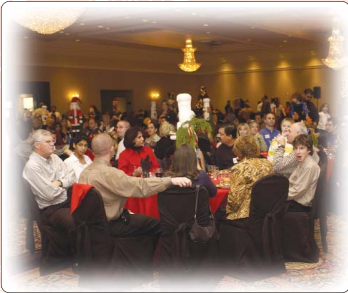
Everyone Enjoying Themselves!