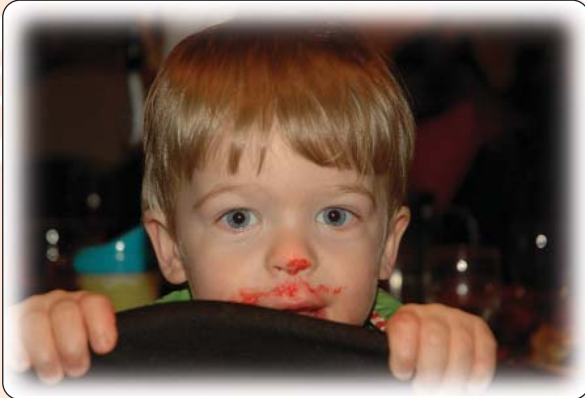
Wow ... This is the Best Party in the World!