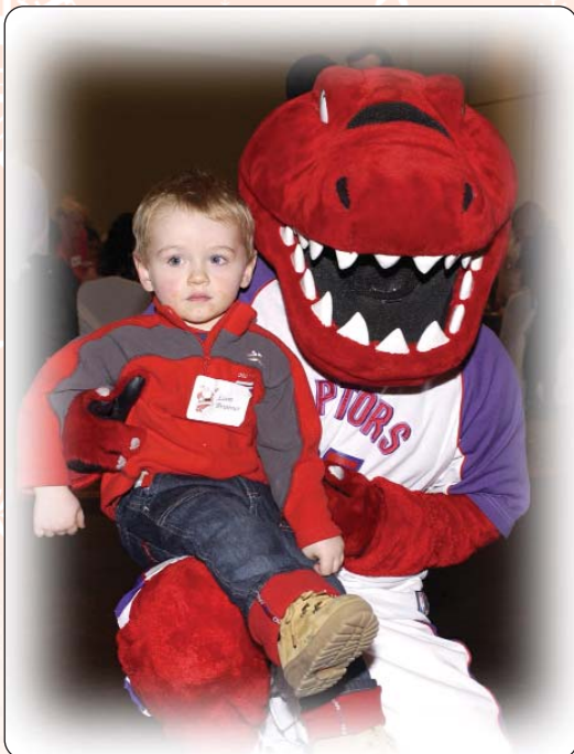
"Mommy .... I Am Scared"