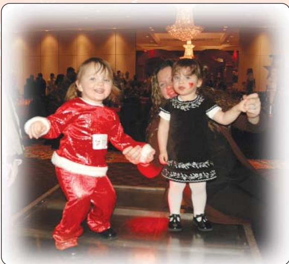
Dance Baby Dance ...