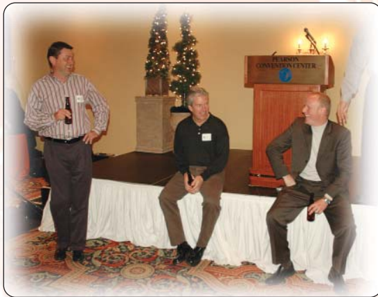
Enjoying a Few Laughs