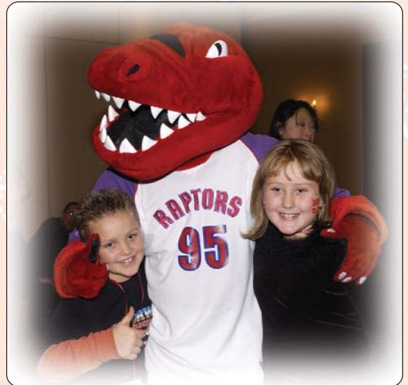
The Little Coopers