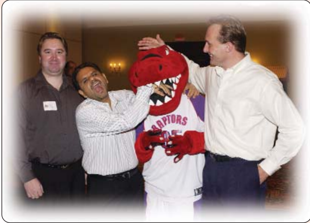
"Come On ... Help Him Out Guys!"