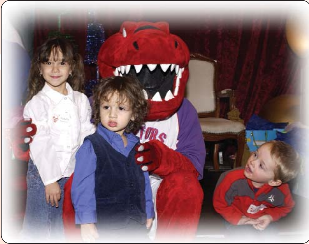
"Hey ... You're Not Santa!"