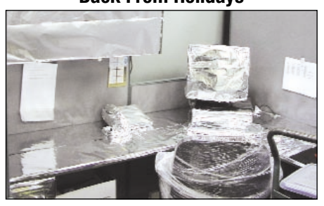
This is what happens when you take 2 consecutive weeks off!!!