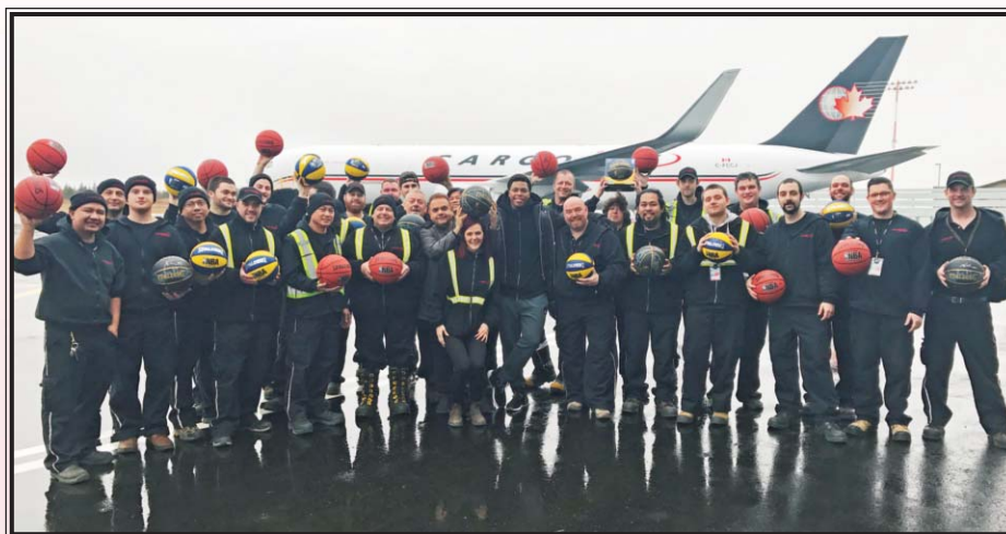
Team St. John's