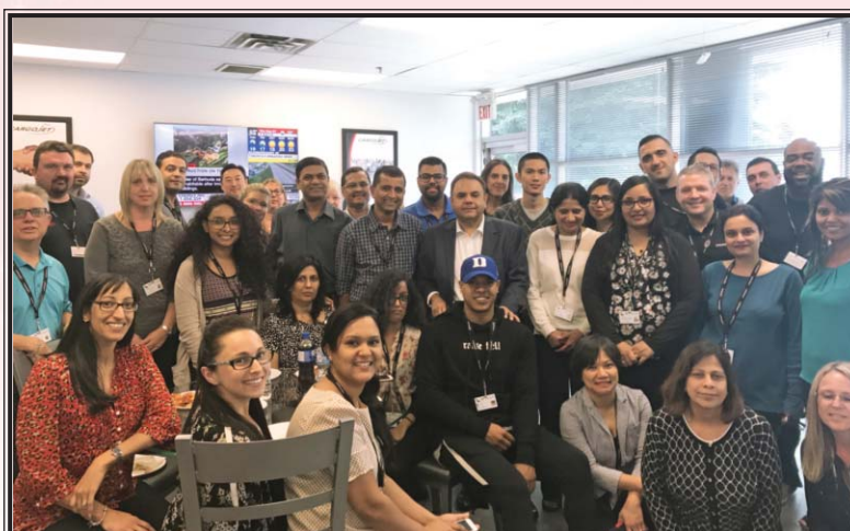
Team Head Office