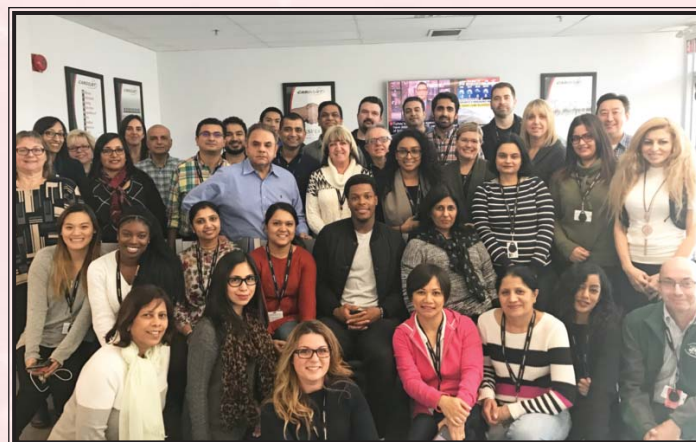
Team Head Office