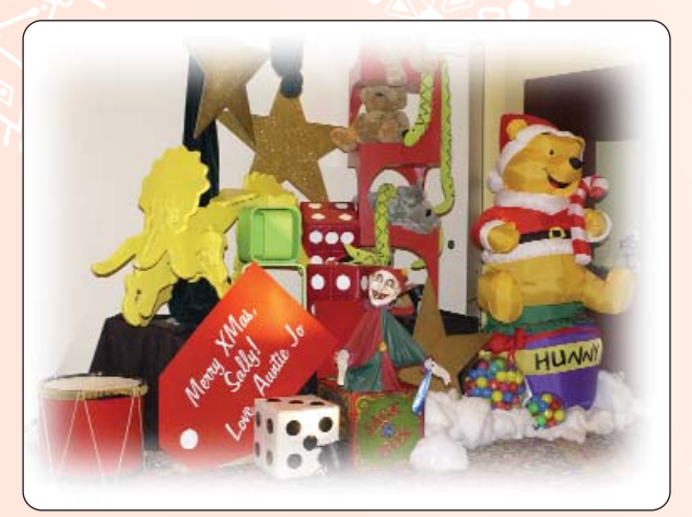
Santa's Toy Shoppe