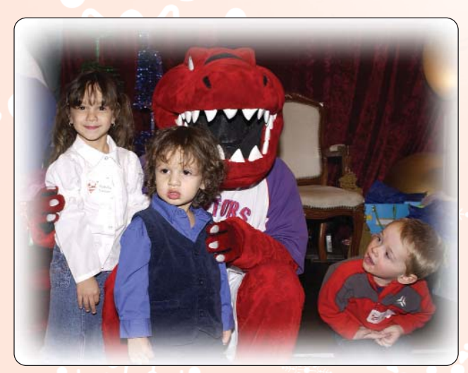
"Hey ... You're Not Santa!"