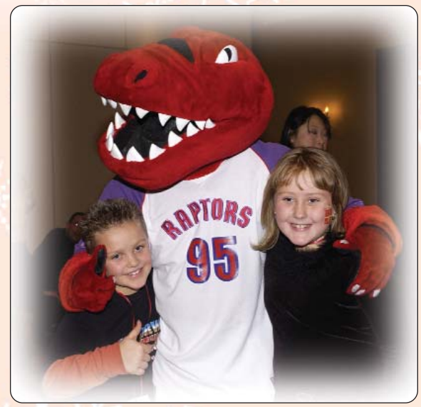
The Little Coopers