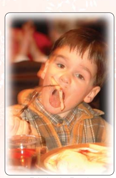
Enjoying the Feast!