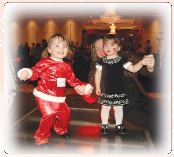
Dance Baby Dance ...