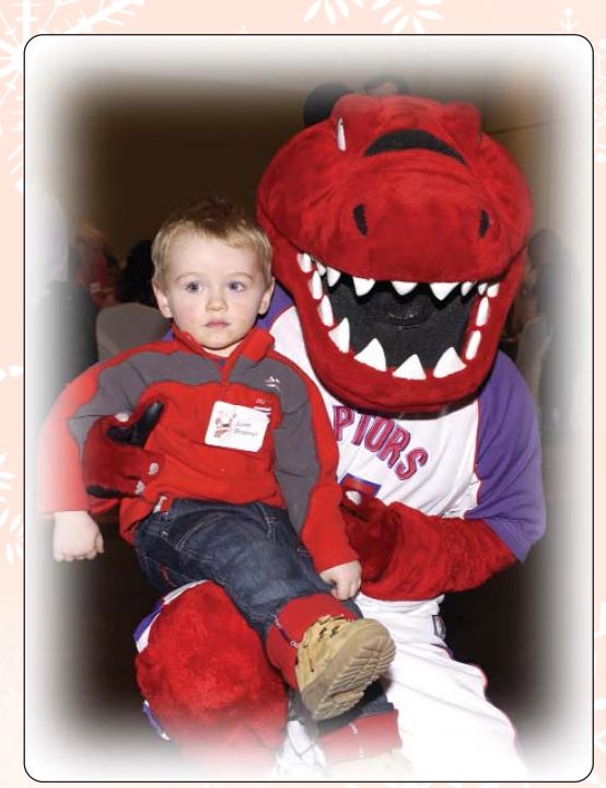
"Mommy .... I Am Scared"