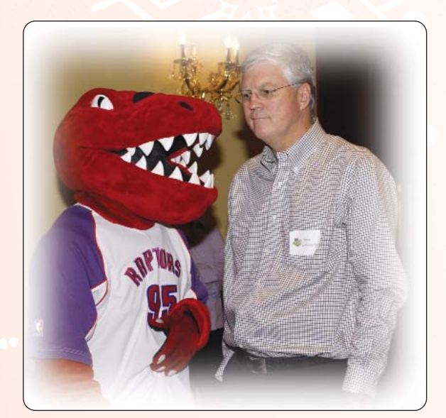
New Addition to The Starjet Sales Team!