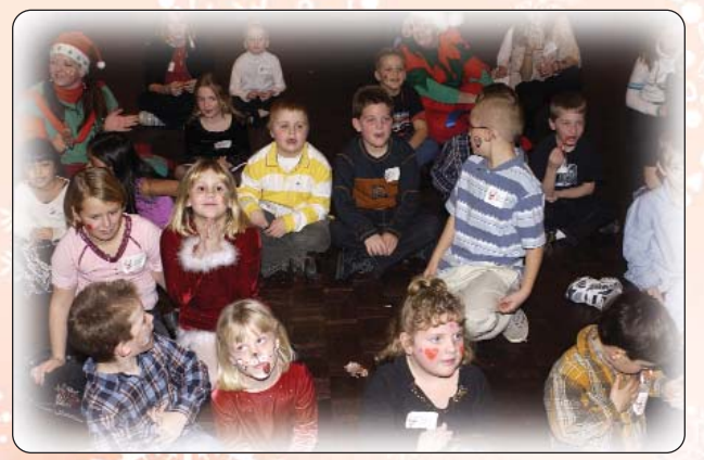
Children in Awe of Santa ...