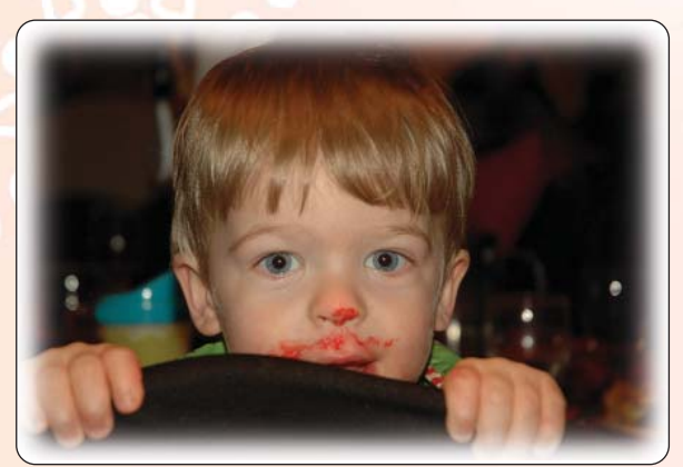
Wow ... This is the Best Party in the World!