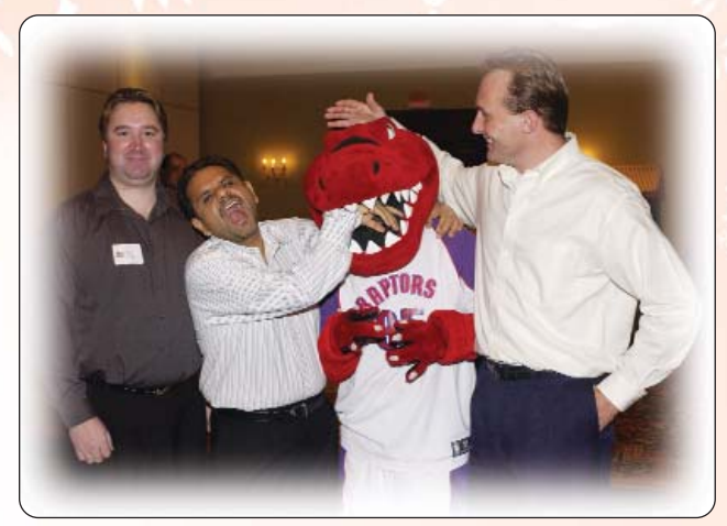
"Come On ... Help Him Out Guys!"