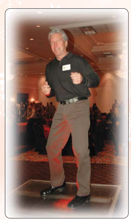
Definitely Needs Dance Lessons!