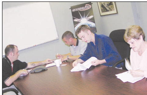
Daily Operations Conference Meeting