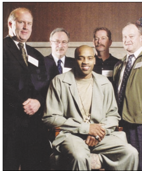
The Sameday Team with Vince Carter at Cargojet Launch